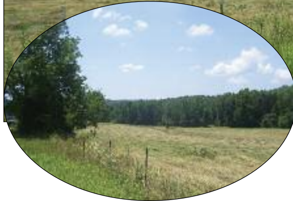
Beautiful rolling pastureland