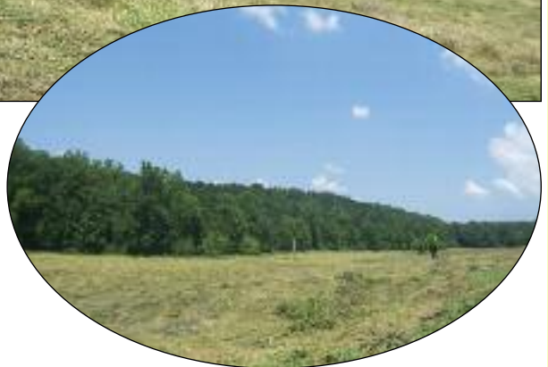
Over 2,600 feet of creek frontage