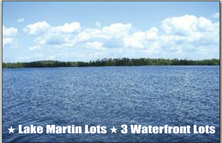
★ Lake Martin Lots ★ 3 Waterfront Lots

MARKET REAL ESTATE AND PERSONAL PROPERTY AT AUCTION AGRICULTURAL ★ COMMERCIAL ★ RESIDENTIAL